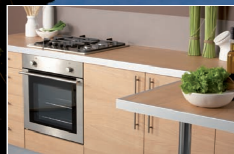
Egger & Kronospan Melamine and Laminates