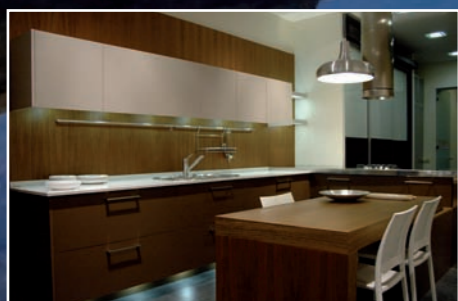
Finesse Veneered MDF