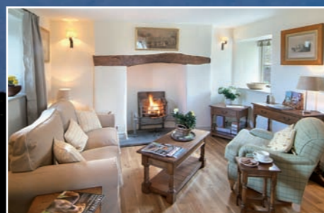
Bausen Hardwood Flooring