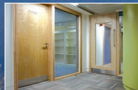
Acoustic & Veneered Fire Doors