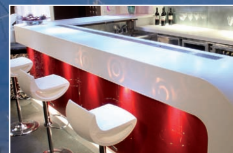
Solid Surface Hi-Macs