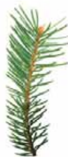
Programme for the Endorsement of Forest Certification Schemes - Chain of Custody Dec 2003