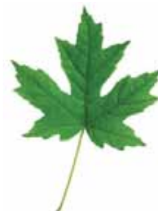
SGS Verified Legal 2004