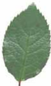
Malaysian Timber Certification Council - 2004