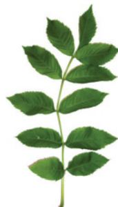
Timber Trades Federation Responsible Purchasing Policy - 2005