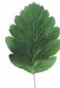
Forest Products Chain of Custody 2006